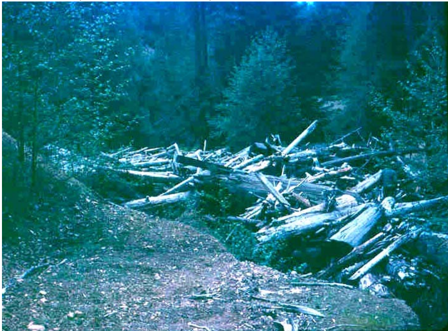
The last four photos are of some aspects of Anderson Creek itself -- historical and recent past.